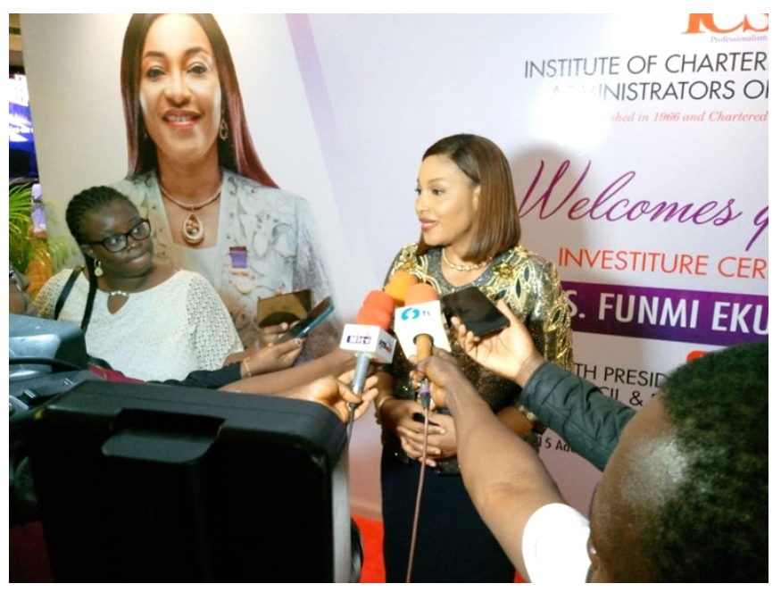
President granting her first interview after the Investiture