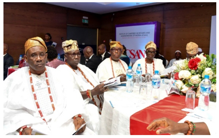
Cross section of some Royal fathers who graced the occasion