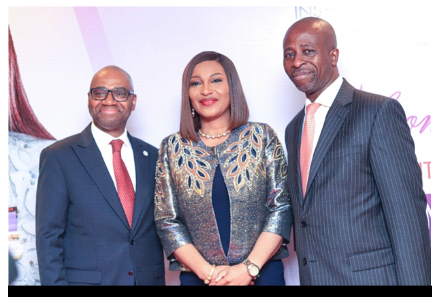
The President with two captains of industry.