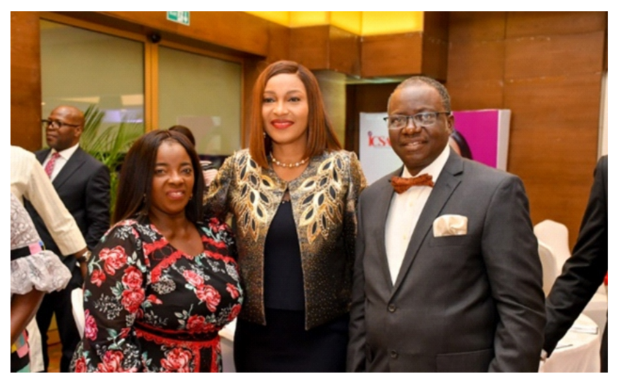
The President flanked on either side by two governance experts who graced the occasion.