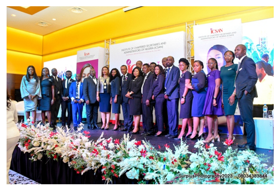
The new President in a group photograph with Members of staff of the ICSAN National Secretariat