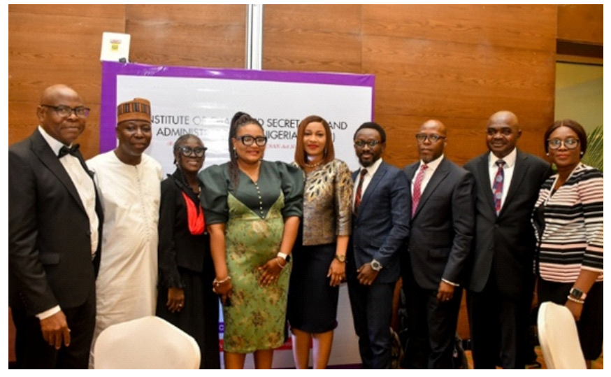
The President flanked with some of the dignitaries.