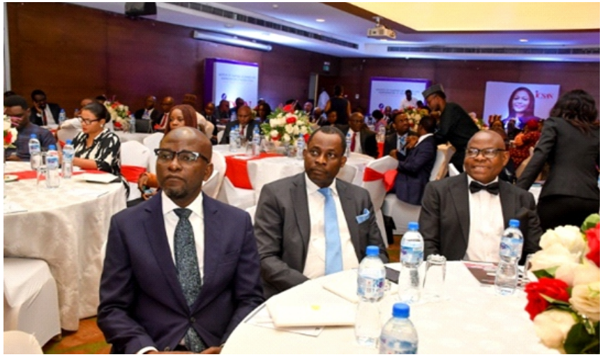
Another cro ss section of fully absorbed Guests.