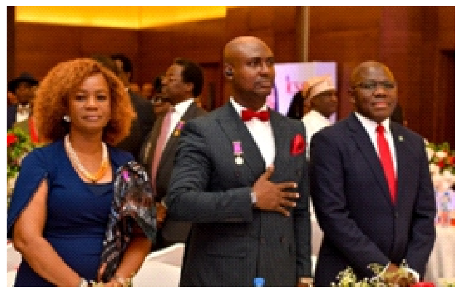
The VP, The Treasurer and a dignitary standing still for the National Anthem