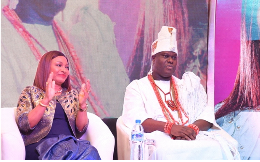
The Presidential applauds a brilliant point by the Keynote Speaker while His Majesty, Ooni of Ife, looks on with keen interest.