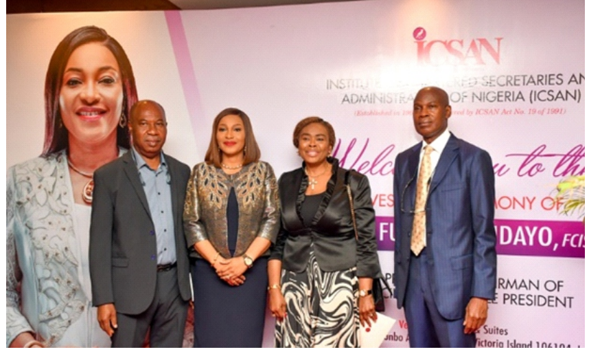
The President with another set of dignitaries.