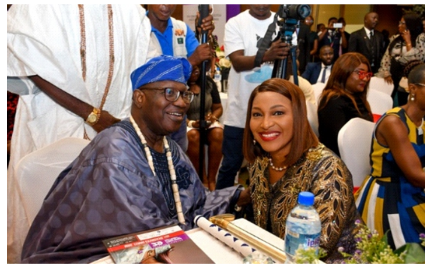
The President greeting an royal dignitary in attendance at the occasion.