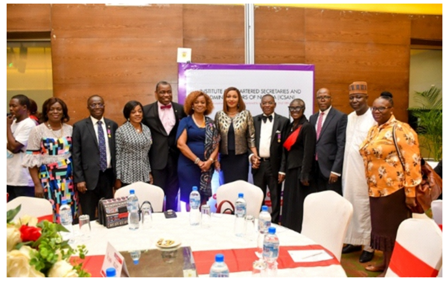
The President in another pose with some Council members and invited Guests.