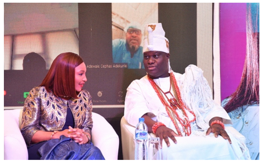
A presidential and royal tete-a-tete going on!